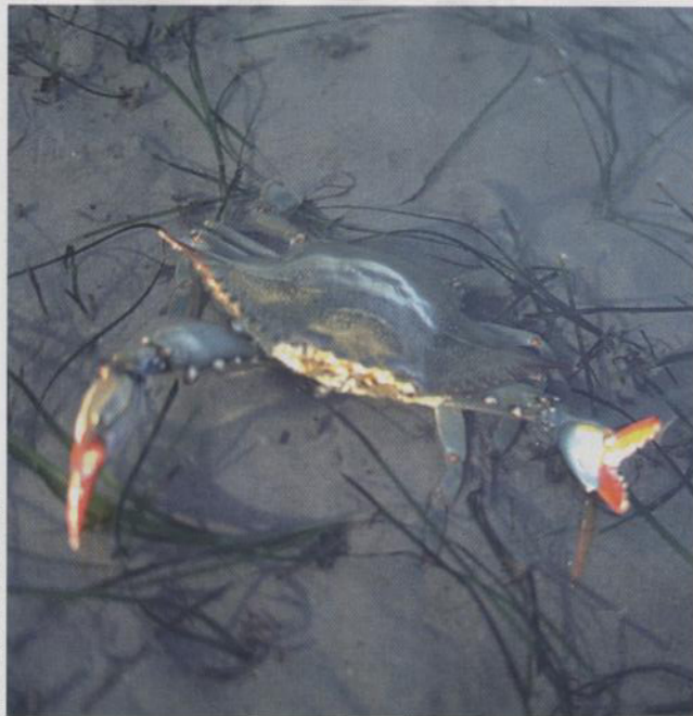
UNH Seagrass Ecology Lab