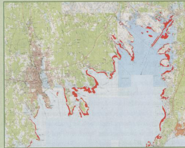
Buzzards Bay eelgrass coverage in 2001.