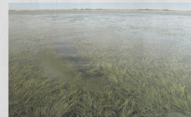
Opposite page: Eelgrass in a bed on Long Island's Peconic estuary struggles against an overabundance of algal epiphytes.