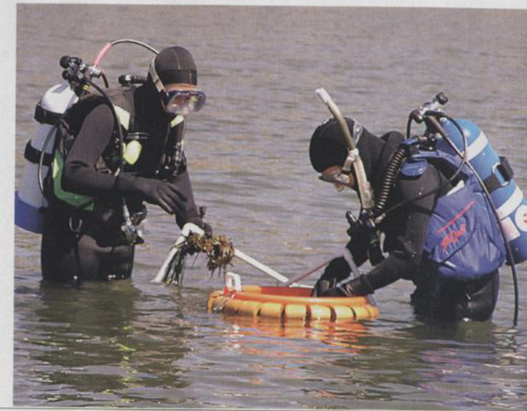
Below: Divers donate their time to harvest eelgrass from healthy beds and replant them in restoration sites.