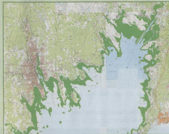
Estimated eelgrass coverage in Buzzards Bay during the 1600s.