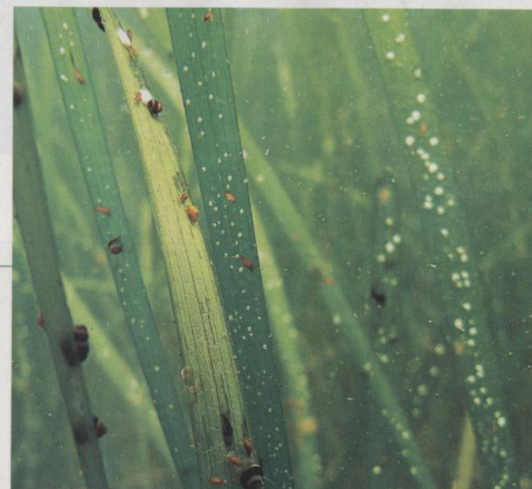
Above: Tiny snails and other small creatures graze on the surface of eelgrass leaves.