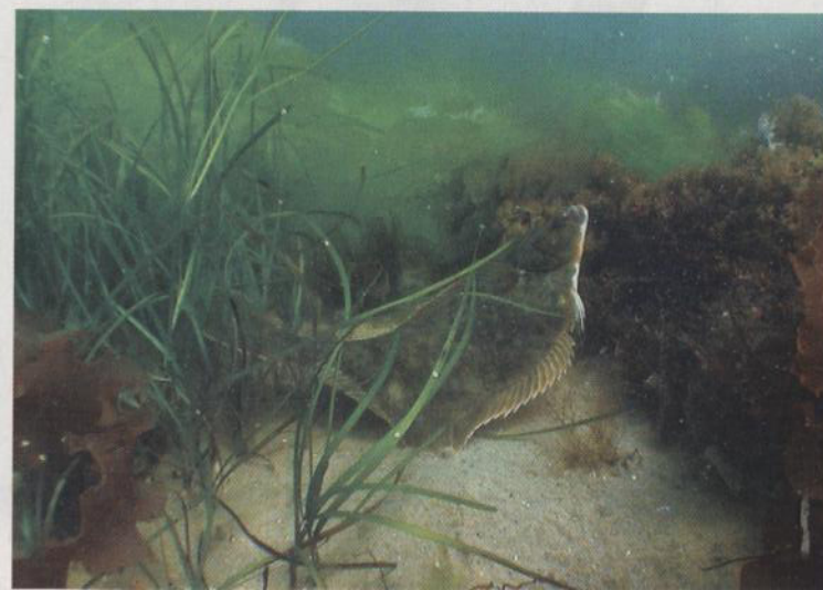
Below: A winter flounder finds food and shelter in a Long Island Sound eelgrass meadow.