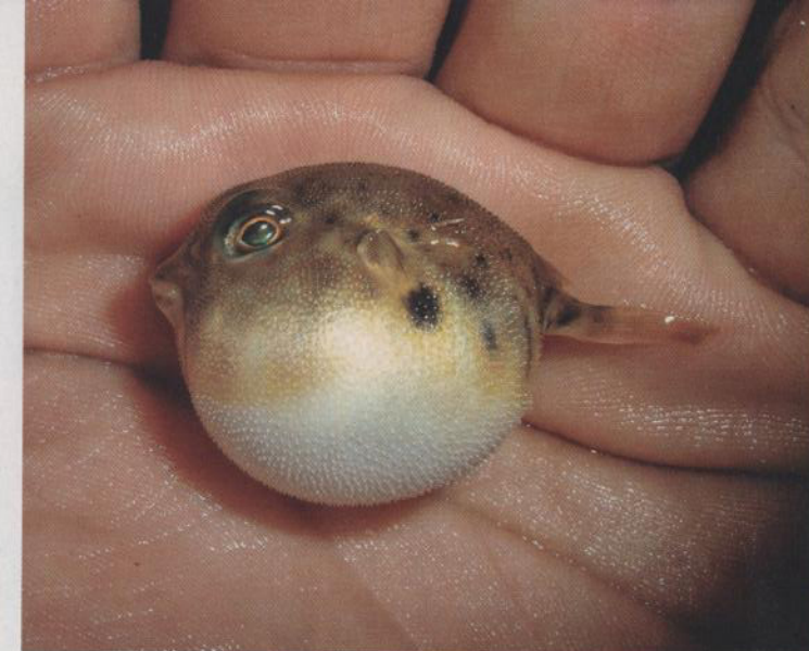
This juvenile northern puffer is one of many fish species that use healthy meadows of Zostera marina as nurseries.

Beds of Zostera marina grow in shallows on the East Coast as far south as the Carolinas, as well as along the Pacific coast, the south coast of Greenland and Europe's North Sea and the Mediterranean. The first great shock to this productive habitat came