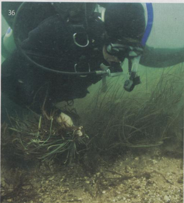
Cornell Cooperative Extension Marine Program, www.seagrass.si.org